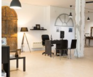
Photo Still life